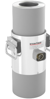
Model 2200 (Shown)